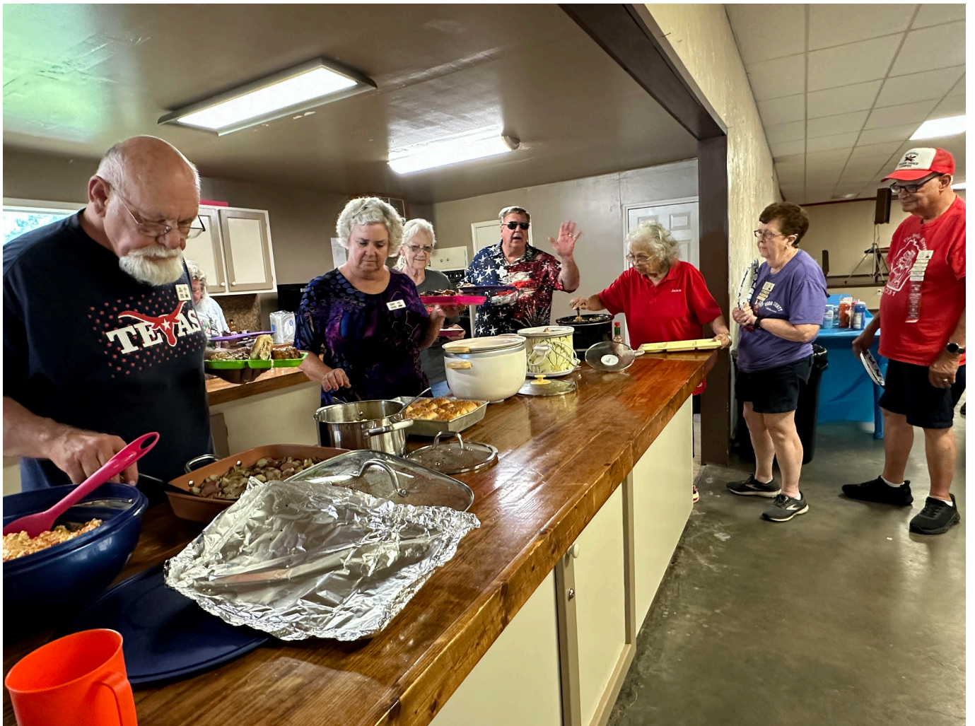
Pot Luck Dinner. Another planned for tonight 4:30-5:30 in Stage Hall.