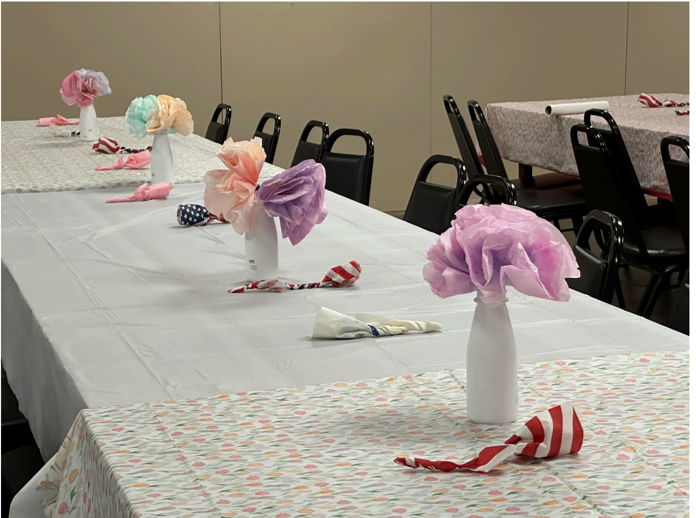
Wednesday crafts, table decorations